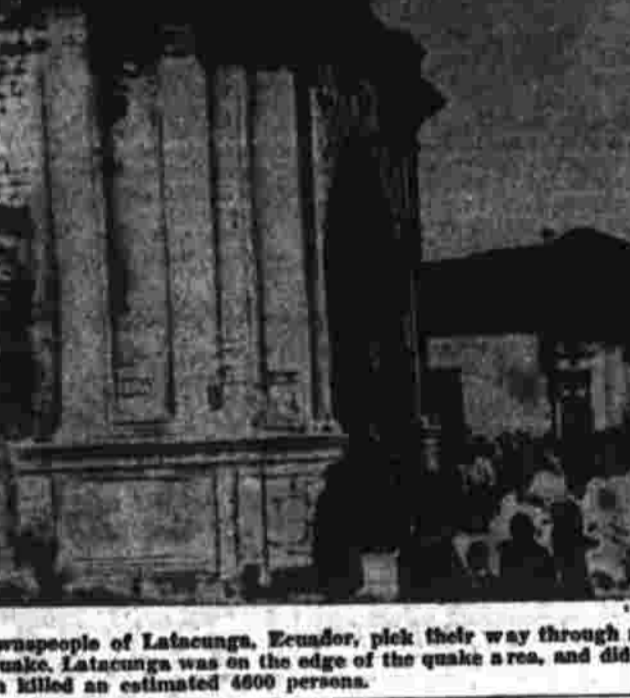
Thousands of Latin Americans, Ecuador, pick their way through rubble in front of La Merced Church after the quake.